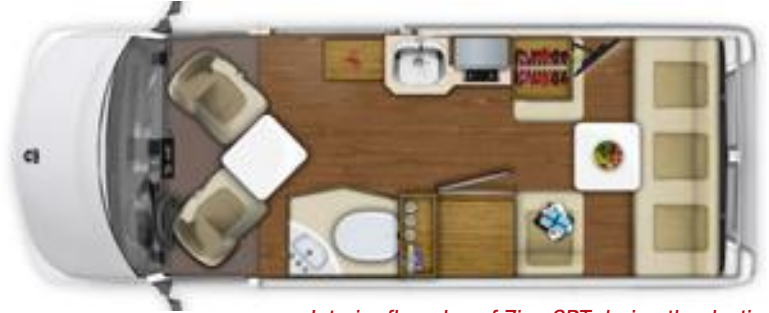
Interior floorplan of Zion SRT during the daytime

Take a step into your beautiful new Zion SRT by Roadtrek. As you turn from your driver's seat, you'll find a pop-in table to enjoy a card game or a nice meal. Looking ahead to your kitchen, you'll be able to prepare a delicious meal on your 2-burner propane stove, and keep your groceries fresh in your 5 cu. ft. refrigerator. You'll have ample storage space in the kitchen including a pull-out pantry and a deep pot drawer. As you make your way through the galley, you'll find a comfortable and spacious permanent bathroom with stand-up shower, and finally arrive to your power composite leather sofa that converts into a queen or two twin bed(s). End your day relaxed; watching your favorite movie on the 24" flat screen television.