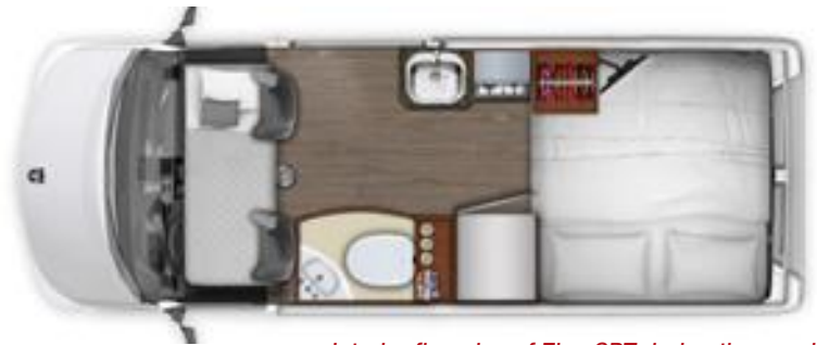
Interior floorplan of Zion SRT during the evening